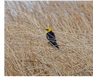
Yellow-headed Blackbird - Kurt Warmbier