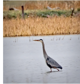
Sandhill Crane-Kurt Warmbier