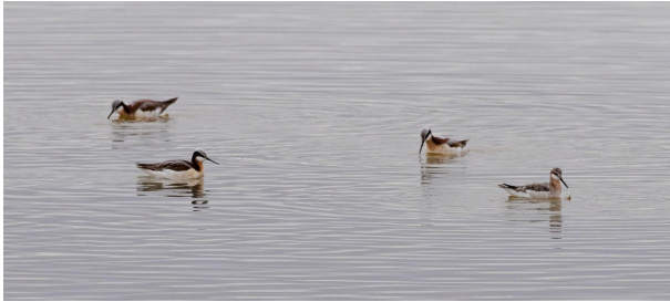
Wilson's Phalarope - Kurt Warmbier - April 2024