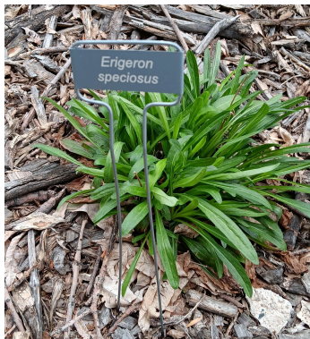
- Erigeron Speciosus label in the Thermopolis Native Garden - April 2024