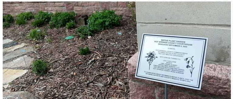
Plaque in the Thermopolis Native Garden - April 2024

The design of the garden focused on providing a calm oasis for courthouse employees and visitors, and the committee incorporated the local high school colors of purple and yellow into the plant choices. With the help of volunteers and materials from organizations like WYDOT, Hot Springs County Road & Bridge, Red Dirt Master Gardeners, and several private businesses, the native garden was dedicated on September 5th of last year. According to the grant report, "4 varieties of shrub, 10 wildflower varieties, and 5 different grasses were used to fill the space" which is on the north side of the 4 story building. Also, "Plant stakes with both the common and scientific names of plants were placed throughout the garden for educational value." In addition to the stakes, one of the partners - Red Dirt Master Gardeners - hosted a free "Basics of Native Plant Landscaping" workshop using the courthouse garden as a demonstration space and handed out native plant publications from WY Game & Fish and the Biodiversity Institute.